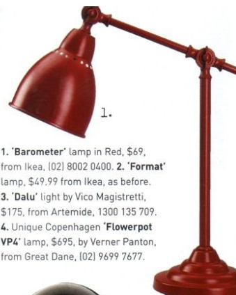
1. 'Barometer' lamp in Red, $69, from Ikea, (02) 8002 0400. 2. 'Format' lamp, $49.99 from Ikea, as before. 3. 'Dalu' light by Vico Magistretti, $175, from Artemide, 1300 135 709. 4. Unique Copenhagen 'Flowerpot VP4' lamp, $695, by Verner Panton, from Great Dane, (02) 9699 7677.