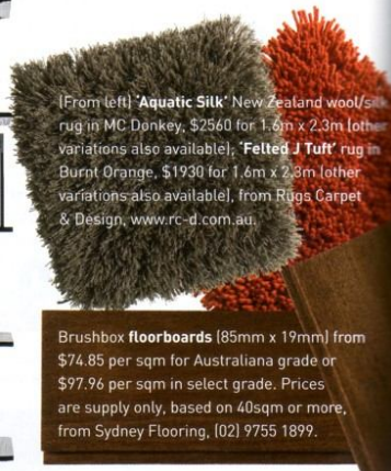
(From left) 'Aquatic Silk' New Zealand wool/silk rug in MC Dankey, $2560 for 1.6m x 2.3m (other variations also available); 'Felted J Tuft' rug in Burnt Orange, $1930 for 1.6m x 2.3m (other variations also available), from Rugs Carpet & Design, www.rc-d.com.au .

If you like the vivid red flokati rug in the lounge, it's worth considering a floorcovering that incorporates different textures – from a soft blend of wool/silk to the chunky, more substantial and tactile feel of tufted wool.